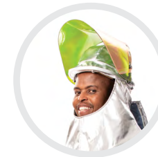
CHARNAUD® METAL-SAFE® Aluminised FR Thermal Lined Hood with Lift Front