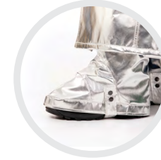
CHARNAUD® METAL-SAFE® Aluminised FR Thermal Lined Spats