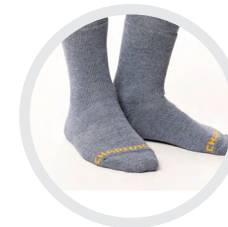
CHARNAUD® METAL-SAFE® FR Thermal Socks