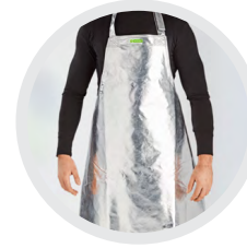
CHARNAUD® METAL-SAFE® Aluminised FR Thermal Lined Apron