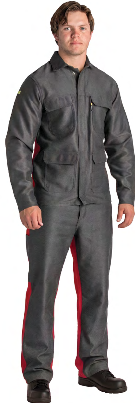
CHARNAUD® METAL-SAFE® Welding suit