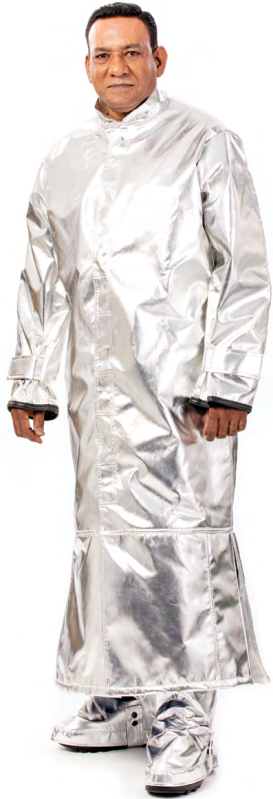
CHARNAUD® METAL-SAFE® Alpan K suit

head-to-foot® range of protective wear is designed to offer protection against molten metal and iron splash, flames and welding splatter. This range is ideal for smelters, furnaces and hot metal welding work. The range offers various other accessories such as face protection, undergarments, gloves, socks, balaclavas and smelter boots.