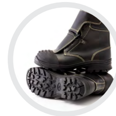
CHARNAUD® METAL-SAFE® Smelter Boot