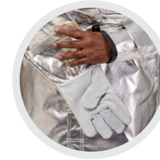
CHARNAUD® METAL-SAFE® Aluminised FR Thermal Lined 5-Finger Glove