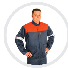
ALU-SAFE®DP Winter Jacket