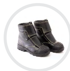
CHARNAUD® Hot Metal Boots