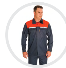
ALU-SAFE®DP Two-tone Open Front Shirt