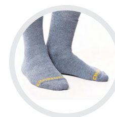
ALU-SAFE®DP FR Thermal Socks