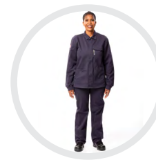
ALU-SAFE®DP Conti suit