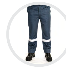
ALU-SAFE®DP Casual trouser