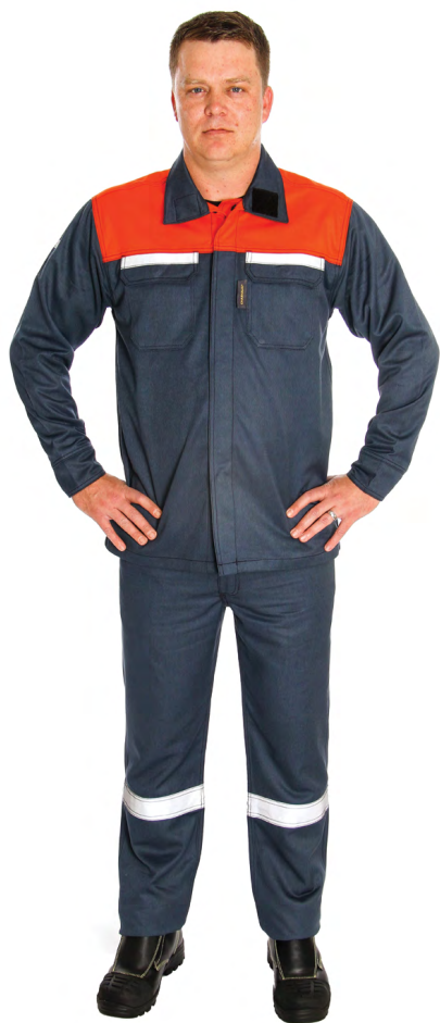
ALU-SAFE®DP Electric Arc Flash, 10 Cal /cm2, CAT 2.

ALU-SAFE®DP is an internationally certified unique high-performance workwear fabric and garment system to protect workers against the hazards of molten aluminium and cryolite (reduction cell flux) splash in primary aluminium smelters and downstream operations. In addition to its unique molten-metal shedding ability (aluminium and cryolite stick to all other known types of material), ALU-SAFE®DP is inherently flame-resistant for the life of the garment and the brand comprises a head-to-foot® range of accessories which include a smelter boot, socks and balaclavas. The comfortable-to-wear natural-fibre ALU-SAFE®DP protective wear is water washable in industrial laundries.